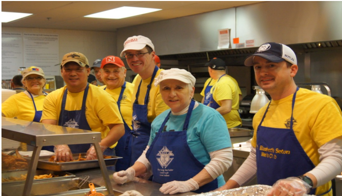
The Serving Line-All smiles