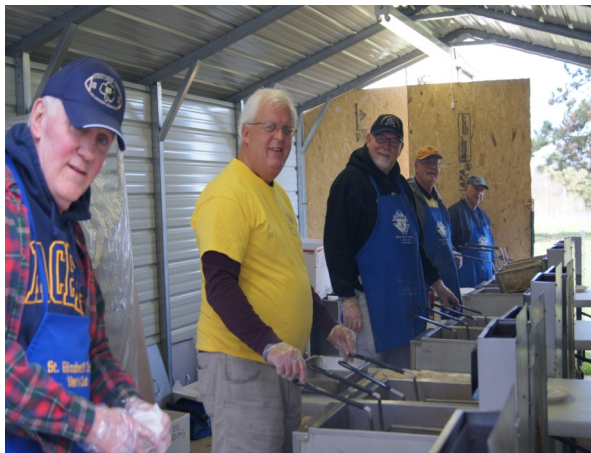
The Cooks-Indispensible Group