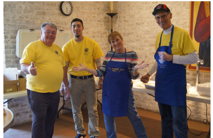
Carry Out Prep Having Too Much Fun